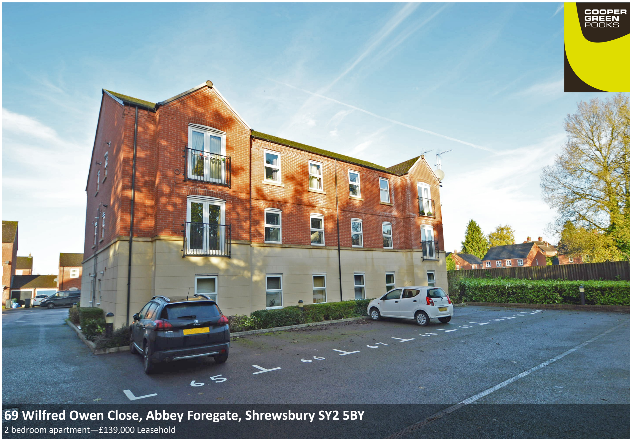
69 Wilfred Owen Close, Abbey Foregate, Shrewsbury SY2 5BY